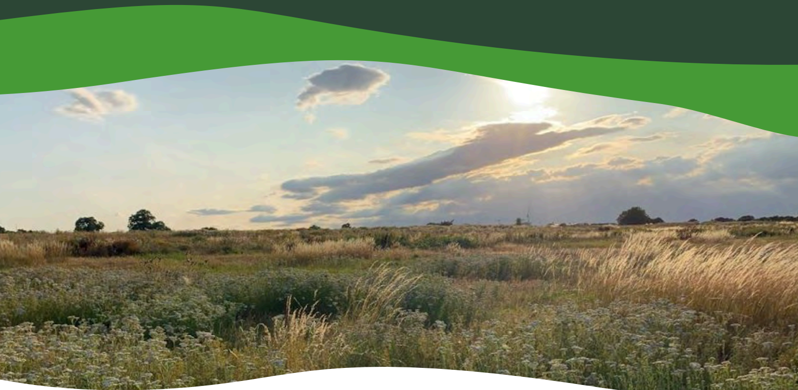
Warren Farm Nature Reserve, one of our Ten New Parks @WarrenFarmNR