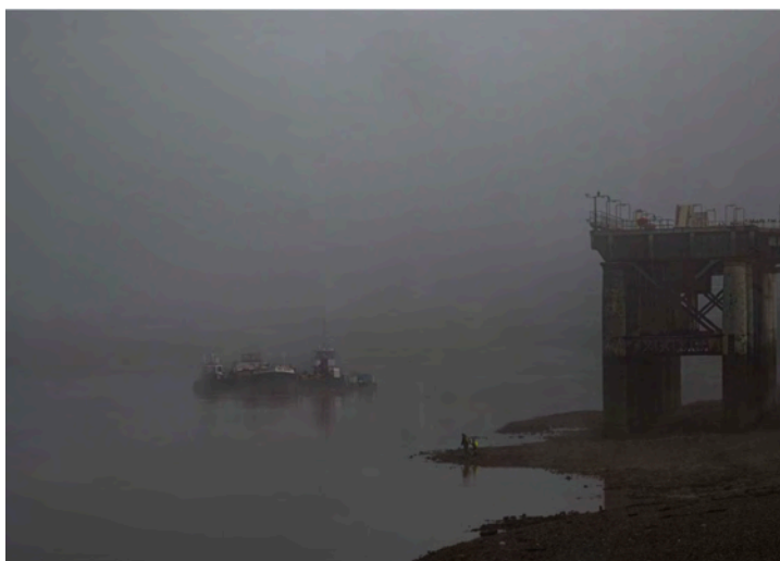
'Family time exploring the Thames shoreline' Greenwich, Health and wellbeing