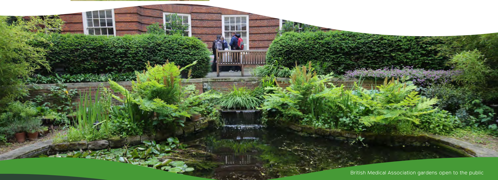
British Medical Association gardens open to the public during London Open Garden Weekend

December: the Ramblers Annual Festival of Winter Walks will take place over Christmas and New Year – a great way to bring 2022 to its natural conclusion.