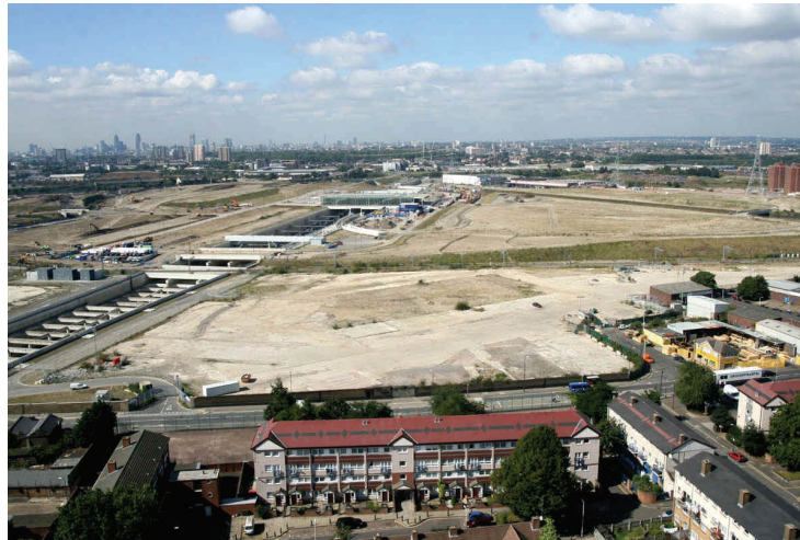
Looking across the 2012 Games Site - More photos from last year's visit can be seen in the website gallery.

If you receive a printed version of this brief update it is because we don't have your e-mail address. The first issue of the e-bulletin will be produced in September so there is plenty of time to subscribe and to tell us what you think we ought to try to include in future.